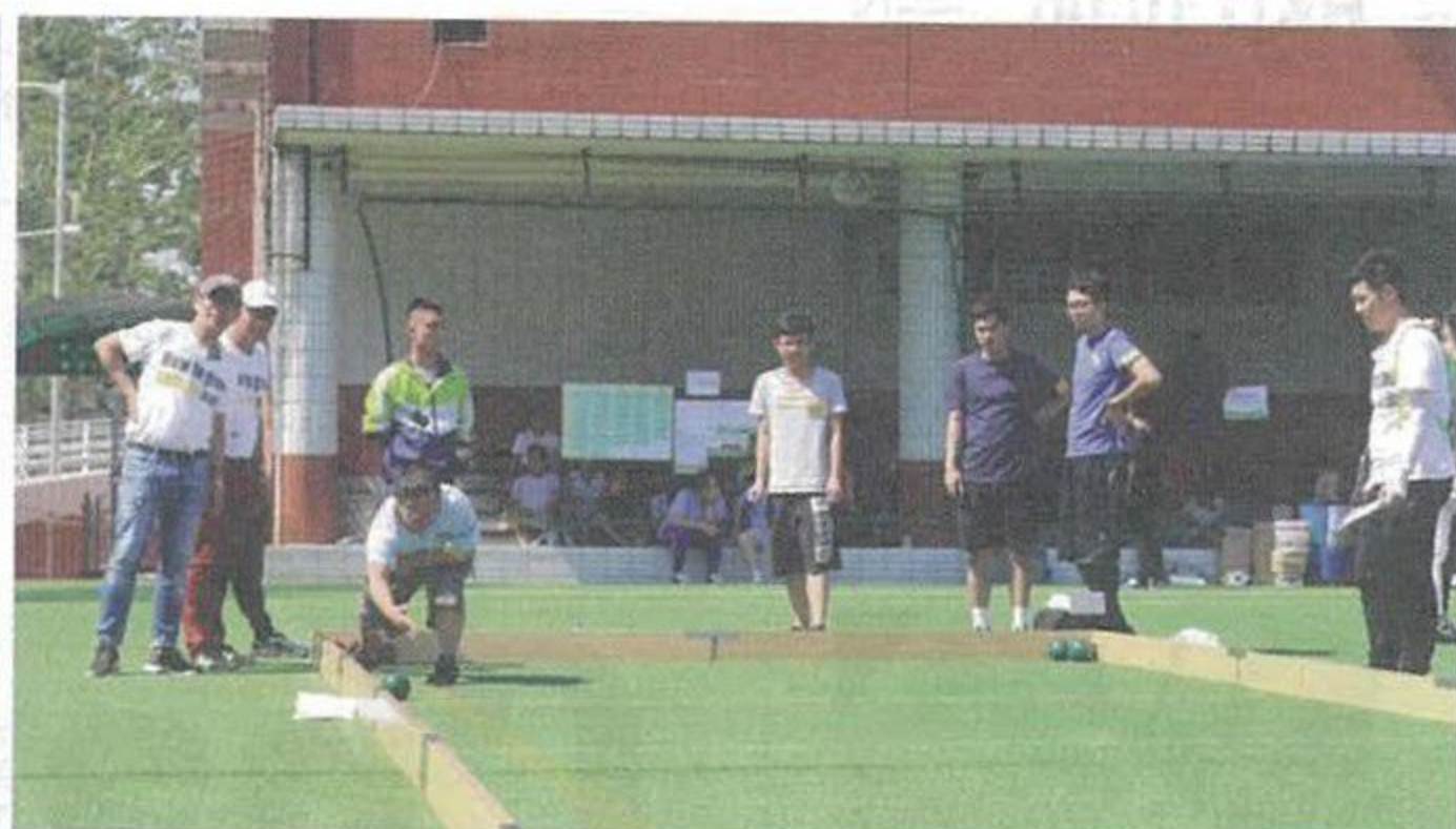
The Bocce tournament

C ESL Asia hosted its annual Sport Fun Day yesterday, aiming to strengthen society's bond through competitive and group games and promote the inclusion of the challenged and underprivileged.